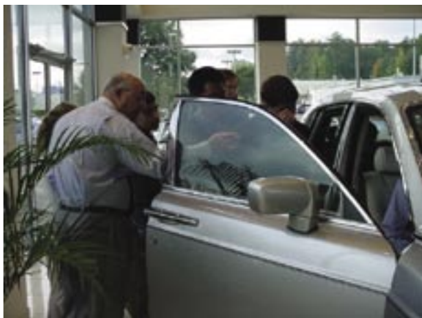
AOF students tour the local BMW/Rolls Royce dealership. Following the tour, they gathered in the conference room and learned about automobile purchasing options.

a senior. A college class is also taken senior year through Wake Tech, the local community college which uses Sanderson High School as an offsite campus at night. Rising 2007 AOF graduates are taking macroeconomics this year. During the summer between their junior and senior years, students participate in a full-time paid internship. This year, members have worked at Wake Med, The North Raleigh Lions Club, Geomagic, and Smith Barney. These young adults go through the process of submitting resumes, applications, and interviewing, and gain the experience of working in the account-