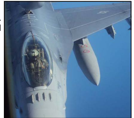
Boom operators view of the F-16

The 916 th Air Refueling Wing at Seymour Johnson AFB, Goldsboro, NC offers orientation flights to AFROTC, AFJROTC, and CAP units. These flights are offered to high school and college students to introduce the students to the mission of the Air Force Reserve. The flights are free of charge to the students.